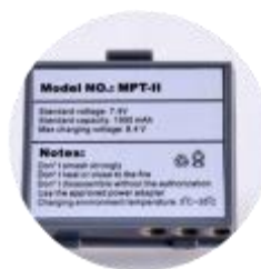
Low Power Consumption