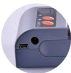
Direct USB Charging(Optional)